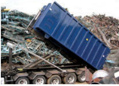
Dual Rear Rollers